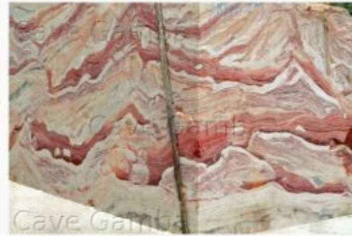
Arabescato Orobico RED

The Arabescato Orobico's wide range of colours guarantees pieces of extraordinary quality and beauty.