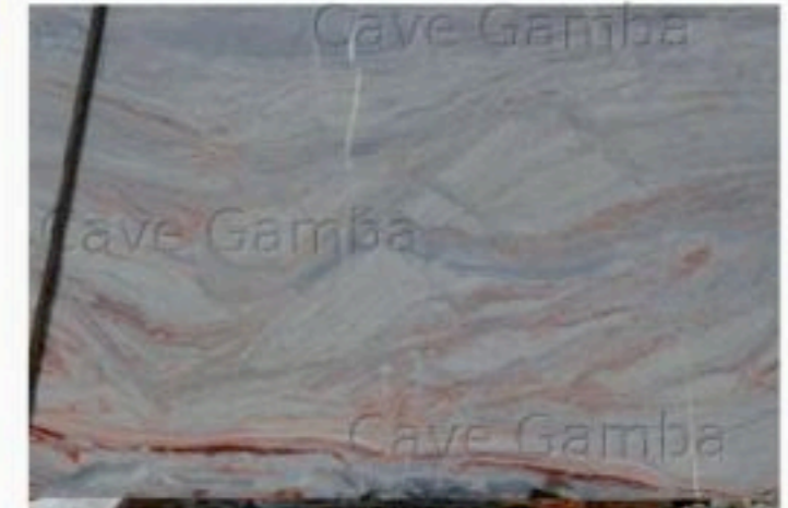
Arabescato Orobico GREY PINK LIGHT