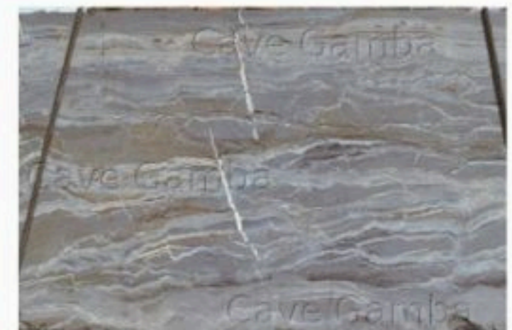
Arabescato Orobico GREY GOLD