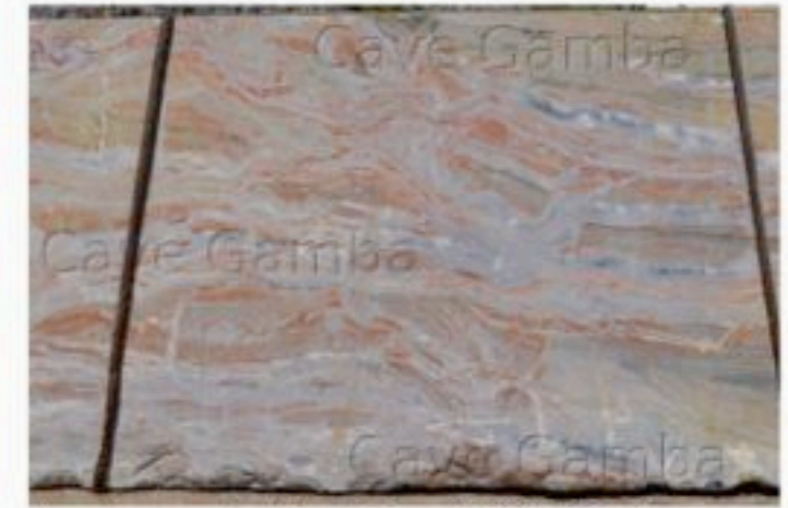
Arabescato Orobico PINK LIGHT