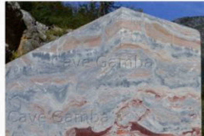
Arabescato Orobico GREY PINK