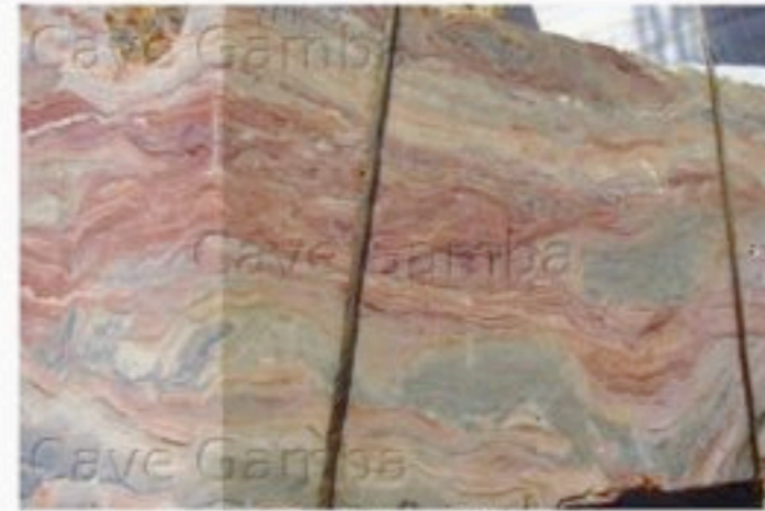
Arabescato Orobico PINK