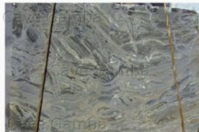
Arabescato Orobico GREY